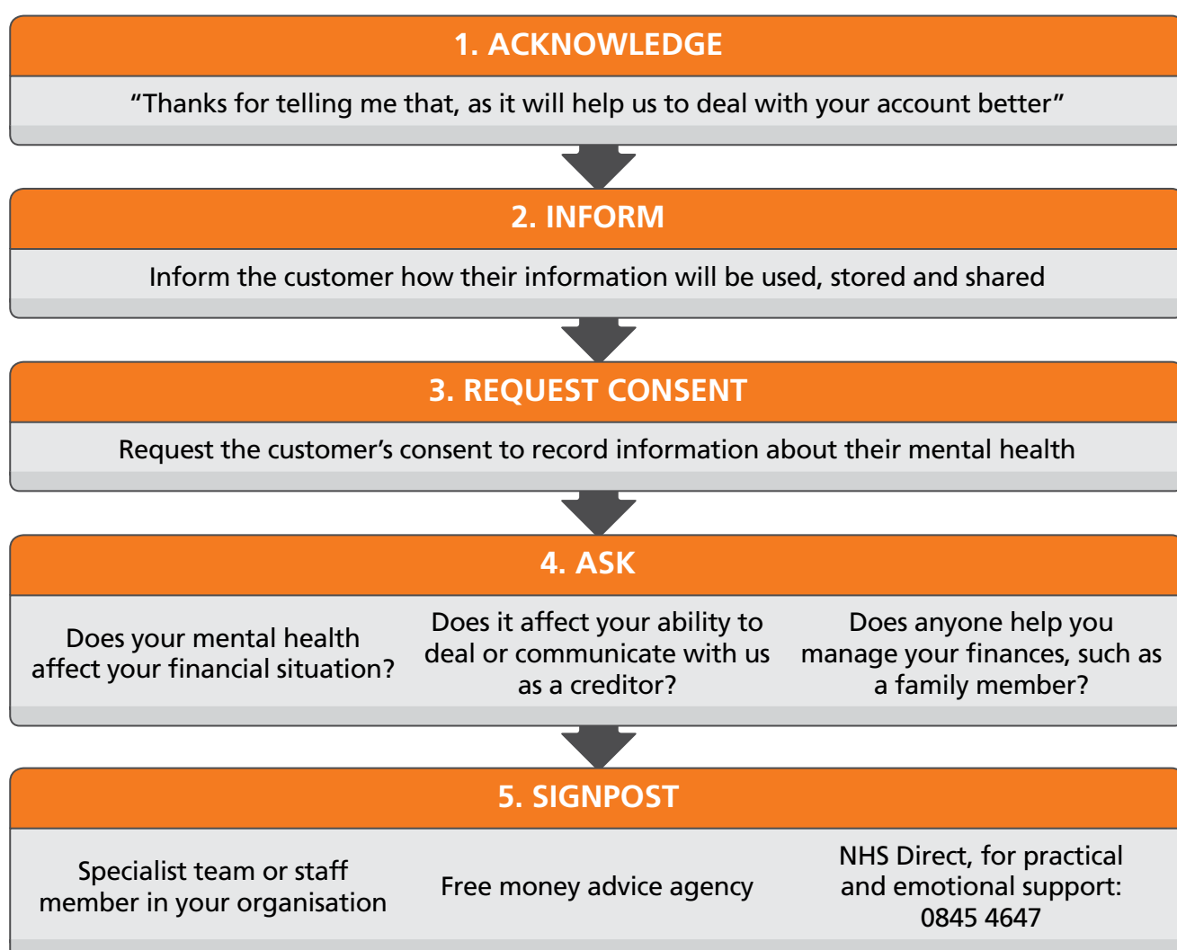
DIAGRAM 1 Dealing with disclosure: a basic drill for frontline staff

Note: Estimated number of employees at small, medium and large call centres based on interviews. Frequencies of disclosure calculated using 30-day month and 12-hour day, based on interviews.